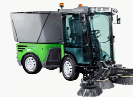
City Ranger 3070