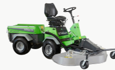
Park Ranger 2150

Download the pictures from www.egholm.eu > about us > Marketing > Downloadables > 04-PHOTOS