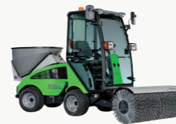
City Ranger 2260